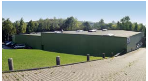
The Remscheid facility: logistics, manufacturing and sales

As a family-managed business with lean structures, we do not just serve our customers with our 50 years of 'manufacturer competence'. We are also represented internationally. With two factories in Remscheid, where it all began, and renowned, reliable suppliers, we always deliver what we promise. Our significant commitment in research and development demonstrates our interest in innovations and tailored customer-specific solutions.